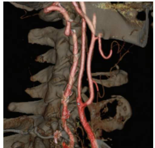
3D Carotid Angio

For further information please contact the practice on (07) 3802 6805 or visit our website at www.qldxray.com.au .